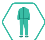
WEAR PROTECTIVE SUIT